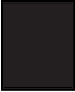
Sen. Teel Bivins