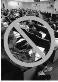
Image on the Web site of the National Center for Academic Transformation (NCAT)

TCCTA hopes to utilize its new blog feature on the association’s Web site to begin an ongoing conversation on this issue. Readers are urged to post comments and questions in a special effort to stimulate thought and discussion. ☆