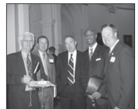
TCCTA will provide bus transportation from the convention site at the Renaissance Austin Hotel. The Legislative Committee will provide information and “Talking Points” for distribution to lawmakers.