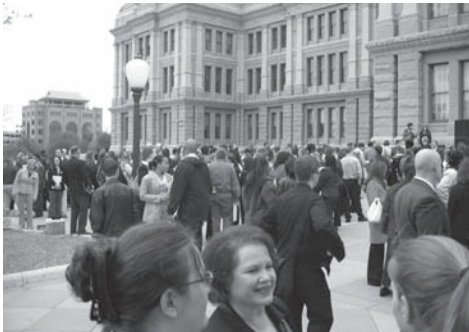
OVER 1000 faculty, students, and college officials participated in Community College Day.