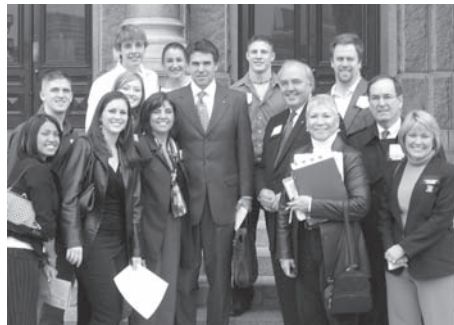
WORKING TOGETHER during Community College Day at the Capitol, faculty, administrators, and students meet with Governor Rick Perry (center).

“At the end of the day, I made the rounds, ask-