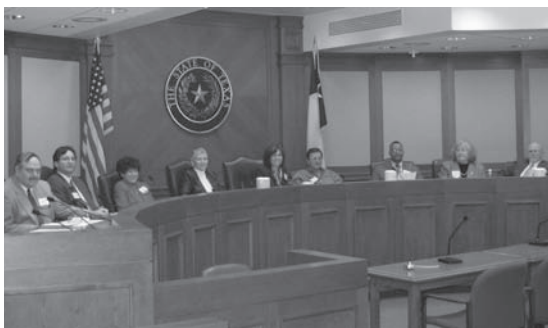
The TCCTA LEGISLATIVE COMMITTEE conducted its meeting in a Capitol Hearing Room.