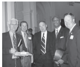
TCCTA provided bus transportation to the Capitol from the convention site at the Renaissance Austin Hotel.